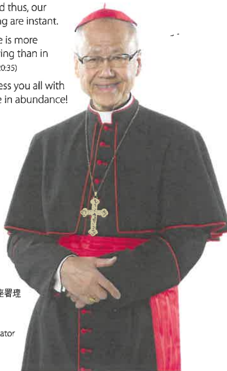
天主教香港教區宗座署理 湯漢樞機 Cardinal John Tong Apostolic Administrator

May the Lord bless you all with grace and peace in abundance!